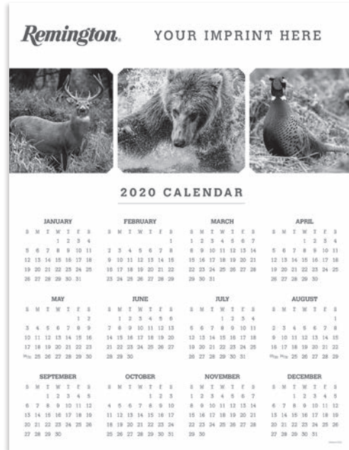
Remington Poster RPOSE.0C014