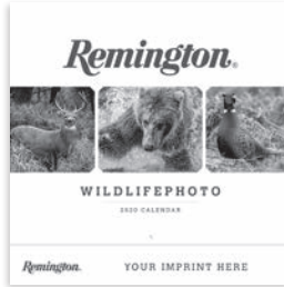
Remington Wildlife Photo RWPE.0C014