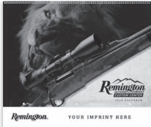
Remington Custom Shop RCSHE.0C014