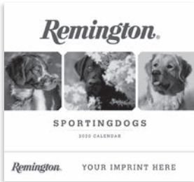
Remington Sporting Dogs RD0GC.0C014