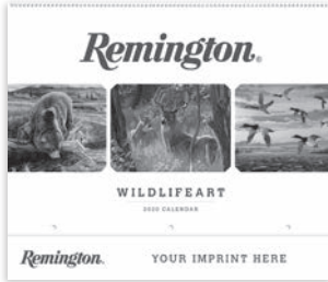
Remington Wildlife Art REMNGC.0C014