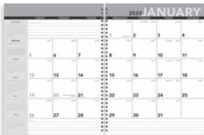
Planner layout for both planner covers