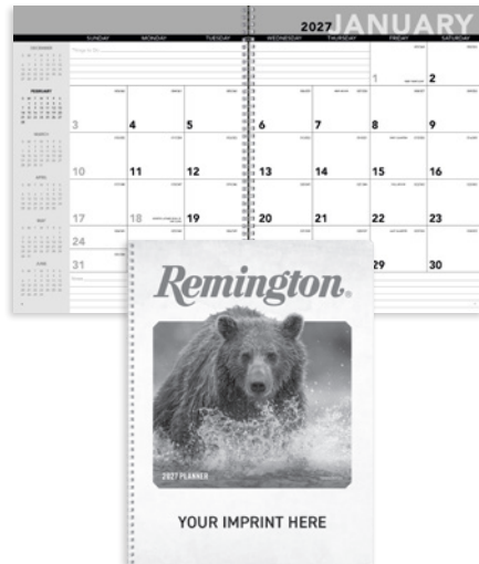
Remington Planner RPLN