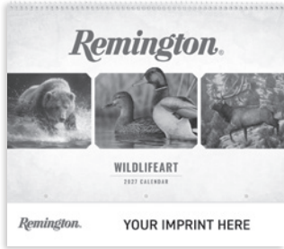
Remington Wildlife Art REMNG