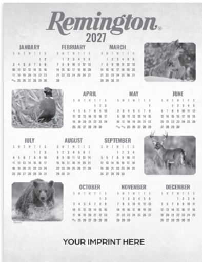
Remington Poster RPOS