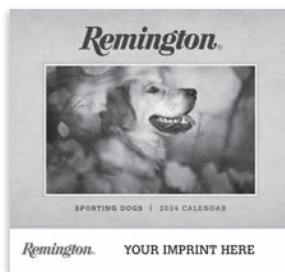
Remington Sporting Dogs RDOG