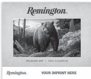
Remington Wildlife Art REMNG