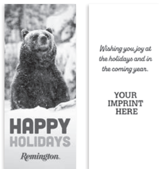
Vertical - RCARV