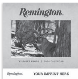
Remington Wildlife Photo RWP