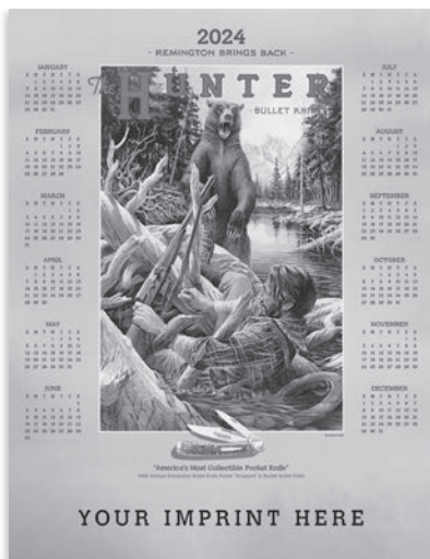
Remington Bullet Knife Poster RPOS