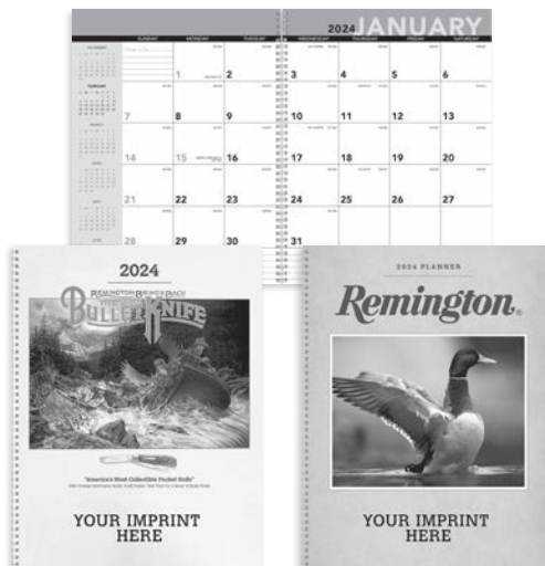
Remington Planners (select from 2 cover options) BULLPL & RPLN