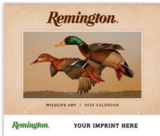
Remington Wildlife Art REMNG