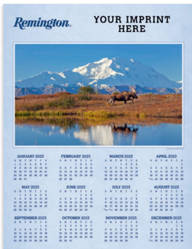
Remington Poster RPOS