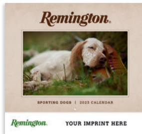
Remington Sporting Dogs RD06