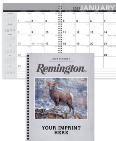
Remington Planner RPLN