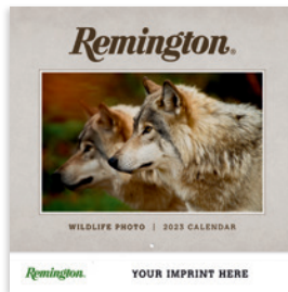
Remington Wildlife Photo RWP