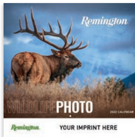
Remington Wildlife Photo RWP