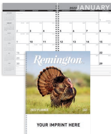
Remington Planner RPLN