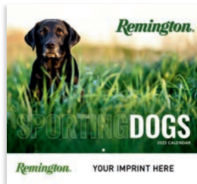
Remington Sporting Dogs RDOG