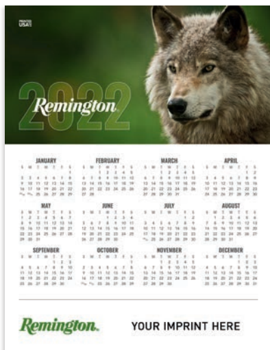
Remington Poster RPOS