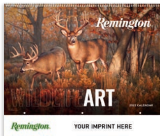
Remington Wildlife Art REMNG