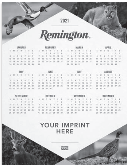
Remington Poster RPOS