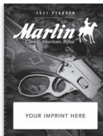
Marlin Planner MPLN