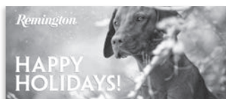
Vizsla - RCARH