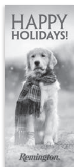
Retriever - RCARV