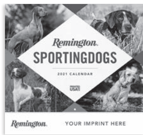
Remington Sporting Dogs RDG