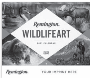
Remington Wildlife Art REMNG