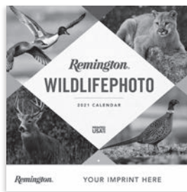
Remington Wildlife Photo RWP