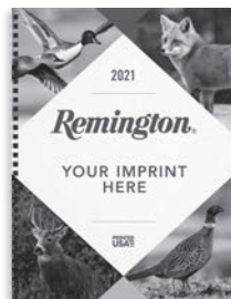
Remington Planner RPLN