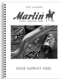
Marlin Planner MPLNE.9C014