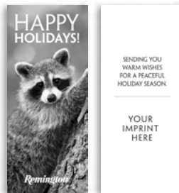
Raccoon - RCARVE.9C014