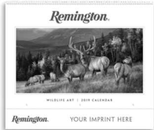
Remington Wildlife Art REMNGE.9C014

Remington ® Marlin ® Classic. American. Rifles.