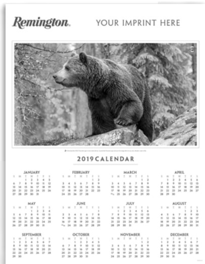
Remington Poster RPOSE.9C014