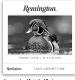
Remington Wildlife Photo RWPE.9C014