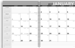
Planner layout for both planner covers