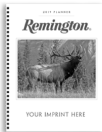
Remington Planner RPLNE.9C014