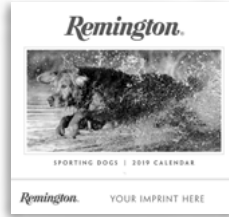
Remington Sporting Dogs RDOGE.9C014